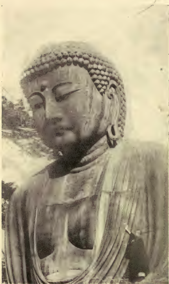
AMIDA BUDDHA AT KAMAKURA, JAPAN

Bronze, of the thirteenth century, 49 ft. 7 in. high