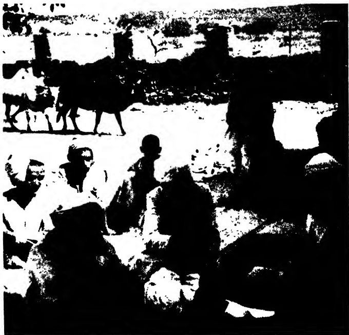
A village meeting (p. 228)