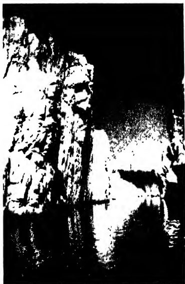
The marble rocks