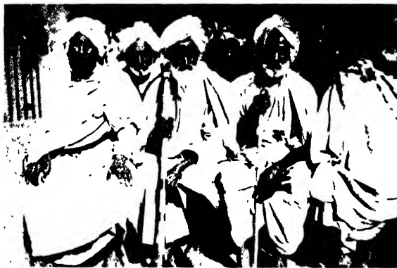
Veteran colonists (p. 81)