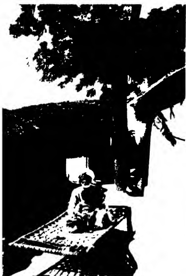
Village interior (p. 193)