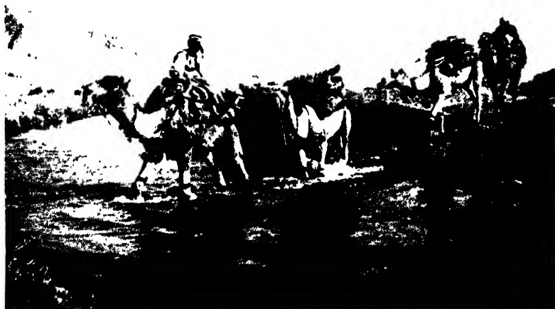
Camels fording a side-stream of the Indus