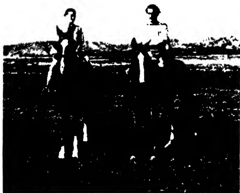
A. and P.