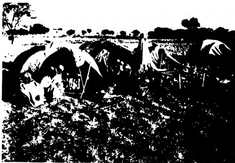
Gipsy encampment near Wah