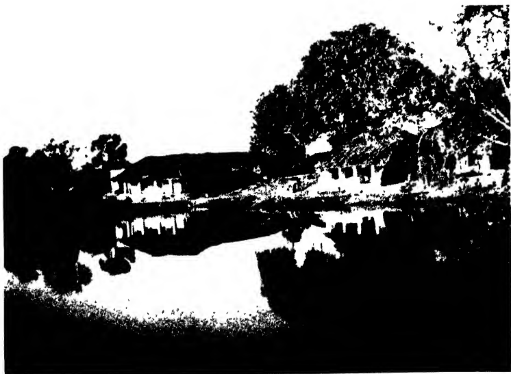
Our last village (p. 291)