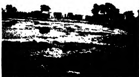
The meeting on December 21 (p. 80)