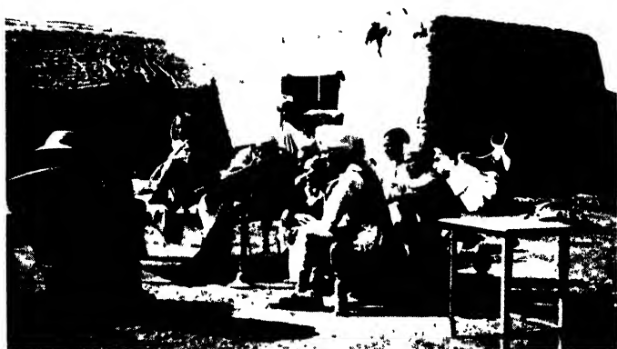
A hospitable courtyard (p. 172)