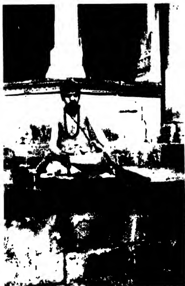
The sadhu (p. 289)