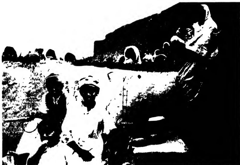
Spectators (p. 42)