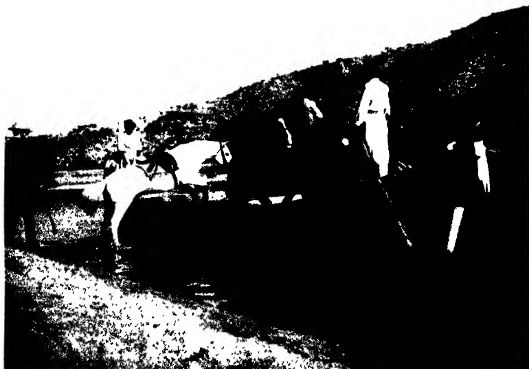
Crossing the Indus : David going on board