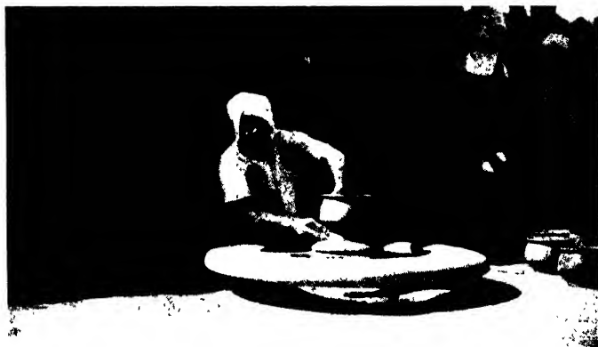
A village potter