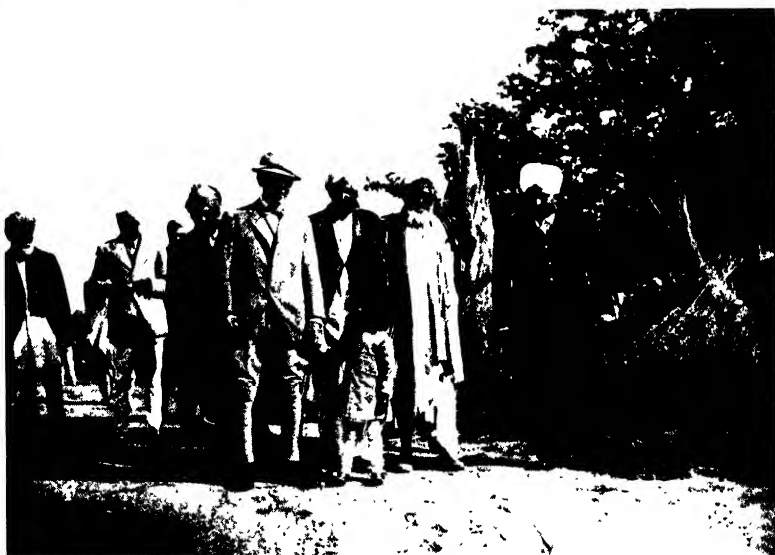
A confiding hand (p. 100)