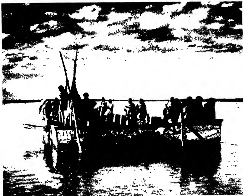
Crossing the Beas