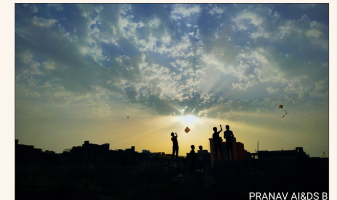
Winning Entries of the Photography Competition