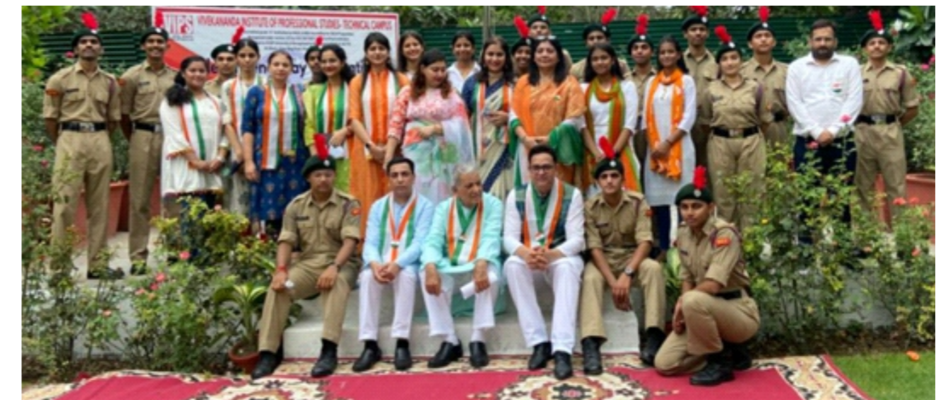
NCC Cadets with faculty members, Vice- Chairmen and Chairman of VIPS- TC